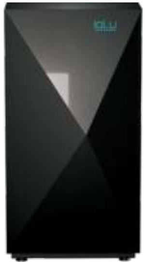
IGLU® Aleut heat pump without water heater

The IGLU Home app allows to control the device in real time, monitor the operating parameters of the heating system, electricity consumption, produced thermal energy and instantaneous efficiency factor.